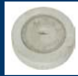
SMS CLEAR OPENING COVER & SURROUND 750178 – Cover Class B & Concrete Surround (370mm clear opening)