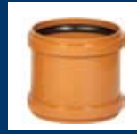
SMS REPAIR CONNECTOR 750165 – PVC Connector 225x225mm SMS SLIP SOCKET 750166 – PVC Slip Socket 150mm 750167 – PVC Slip Socket 225mm