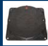
SMS CLEAR OPENING COVER & FRAME 750140 – Class D Ductile Iron Cover & Frame (400mm clear opening)