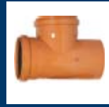
SMS PVC TEE 750187 – PVC Tee 225x225mm