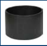
SMS POLY SHROUD 750138 – Poly Shroud 400mm