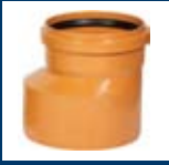
SMS PVC REDUCER 750175 – PVC Reducer 300x225mm 750176 – PVC Reducer 150x100mm