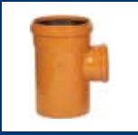
SMS PVC DROP TEE 750104 – PVC Drop Tee 225x150mm 750186 – PVC Drop Tee 225x100mm