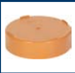
SMS PVC PUSH ON CAP 750191 – PVC Push On Cap 225mm