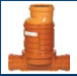
SMS MAINTENANCE SHAFT STRAIGHT 750100 – PPR Maintenance Shaft 300x150mm Straight (includes 300/225 Reducer)