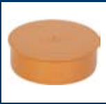
SMS PVC PUSH IN PLUG 750141 – PVC Push In Plug 150mm