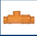
SMS MAINTENANCE SHAFT STRAIGHT 750185 – PVC Maintenance Shaft 225x225mm Straight