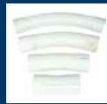
SMS PVC SWEEP BEND 1020MM RADIUS 750180 – PVC Sweep Bend 150 x 5 deg 750181 – PVC Sweep Bend 150 x 10 deg 750182 – PVC Sweep Bend 150 x 15 deg 750183 – PVC Sweep Bend 150 x 30 deg 750184 – PVC Sweep Bend 150 x 45 deg