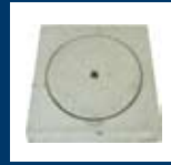
SMS CONCRETE SHAFT COVER 750179 – Concrete Shaft Cover Light Duty (340mm clear opening) 750112 – Concrete Shaft Cover Light Duty (400mm clear opening)