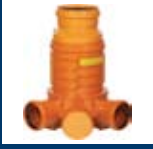
SMS MAINTENANCE SHAFT JUNCTION 750102 – PPR Maintenance Shaft 300x150mm Junction (includes 300/225 Reducer & 150 Plug) 750177 – PPR Maintenance Shaft 400x150mm Junction (includes 400/300 Reducer & 150 Plug)