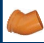
SMS PVC BEND 750188 – PVC Bend 225 x 15 deg 750189 – PVC Bend 225 x 30 deg 750190 – PVC Bend 225 x 45 deg