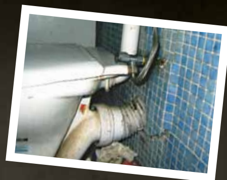
Pushing sewerage uphill?

A: Maybe go on holiday. I would like to go to see China.