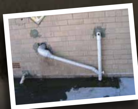
Can waste be reduced in size?