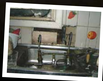
Innovative use of flexible hoses.

For all the winning entries and to hear what the Judges had to say about the disasters go to www.reece.com.au/diydisasters