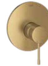
Essence New Shower Mixer

Brushed Nickel Hard Graphite Brushed Cool Sunrise