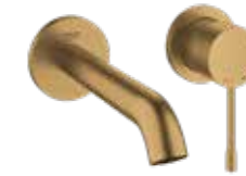
Essence New Wall Basin Mixer Projection: 183mm WELS 5 star, 6 ltrs/min

Brushed Nickel Hard Graphite Brushed Cool Sunrise