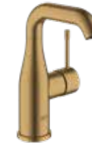
Essence New Basin Mixer WELS 5 Star, 6ltrs/min

Brushed Nickel Hard Graphite Brushed Cool Sunrise