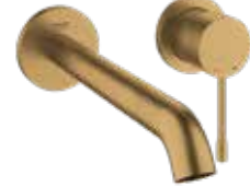
Essence New Bath Set

Brushed Nickel Hard Graphite Brushed Cool Sunrise