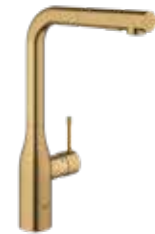
Essence New Pull Out Sink Mixer WELS 5 star, 6ltrs/min

Brushed Nickel Hard Graphite Brushed Cool Sunrise