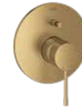
Essence New Shower Mixer with diverter

Brushed Nickel Hard Graphite Brushed Cool Sunrise